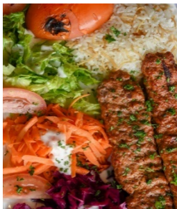
IZMIR KÖFTE (OBLONG MEAT PATTIES WITH RICE AND SALAD)