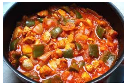
TRADITIONAL TURKISH CHICKEN STEW (WITH RICE AND SALAD)

*MAY NOT APPEAR AS SHOWN BECAUSE ROSE IS MAKING THIS DISH ESPECIALLY FOR US*