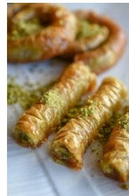
BAKLAVA (WITH PISTACHIO OR WALNUT)